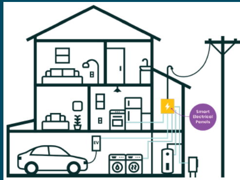
Smart Electrical Panels