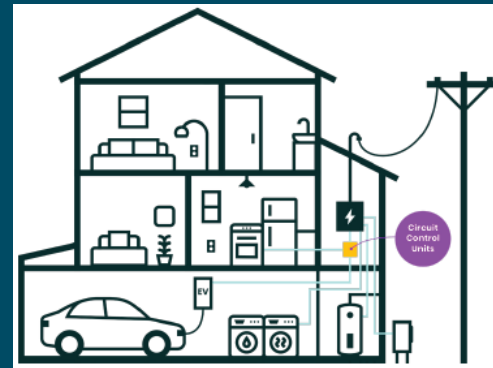
Circuit Control Units